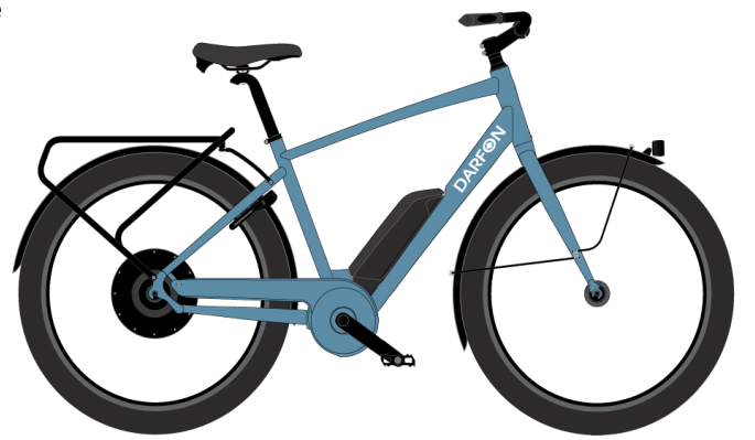
Battery Pack 48V 14Ah(672Wh) CAN