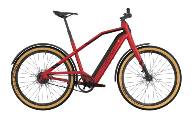
(SMART) CONTROLLER 36V 250W CANBUS